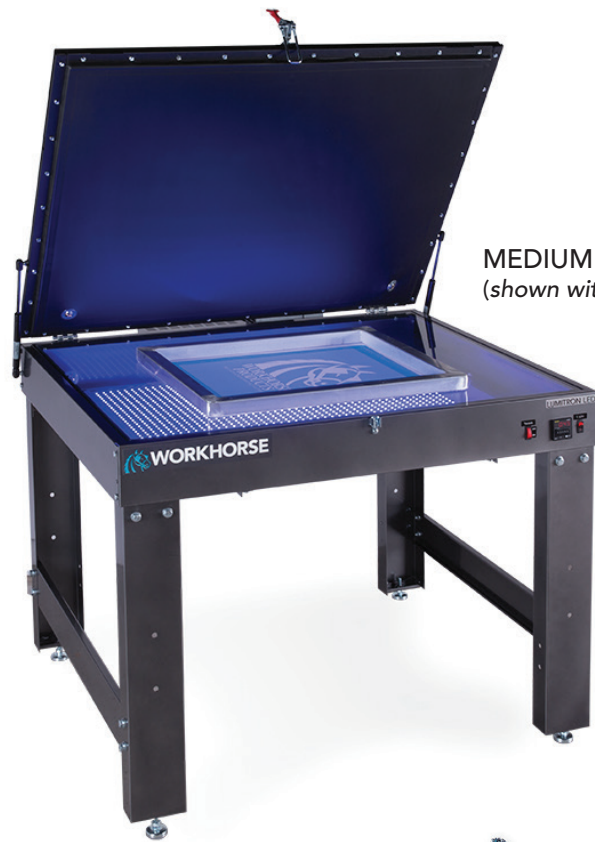
MEDIUM (shown with optional legs)