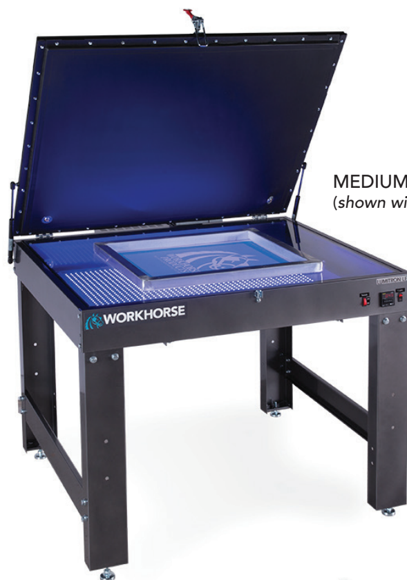
MEDIUM (shown with optional legs)